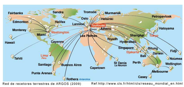
Figure 2. The CLS Argos ground station network circa 2009.