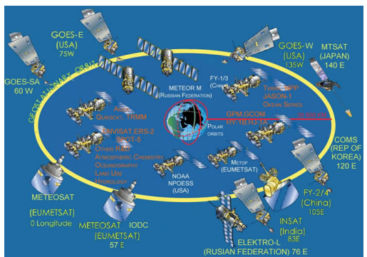
Figure 1. A snap shot of current meteorological satellites.

Satellite observations of the Antarctic are of critical importance to both research and operations. The last several years have seen many changes in both satellites available as well as the plans for future meteorological satellite systems. This presentation reviews the status of the dynamic meteorological satellites (Figure 1) as they pertain to the Antarctic. Reviews of polar orbiting and geostationary satellites will be followed uр by discussion of relevant meteorological satellite communications such as the Argos system (Figure 2). Future and planned launches will also be discussed (e.g. Figures 3 and 4).