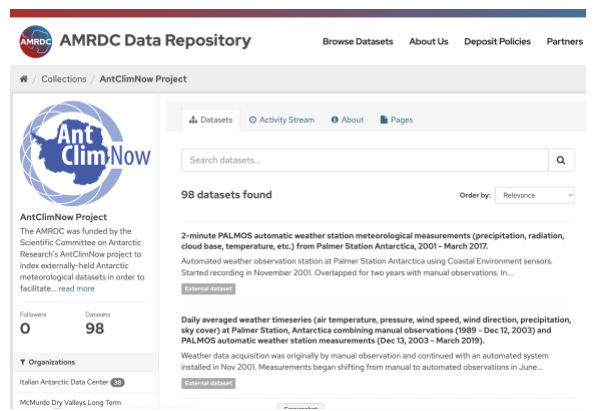
Figure 2. Here is an example of a collection, from the AntCLIM<sup>now</sup> project.

One important collection that is a part of the repository are links to other Antarctic meteorological data in other disparate data repositories around the world. supplementary effort has been "seed" funded and supported by the SCAR project AntCLIM<sup>now</sup> with an aim to not create new datasets but find ways to bring datasets together. This will enable AMRDC Data Repository users to find data not only in the repository but data in other external repositories. This is an extension of the FAIR (Findable Accessible, Interoperable, and Reusable) principals this project adheres to. Currently, nearly 99 datasets have a linked entry in the AMRDC Data Repository. Moving forward, we will continue this effort and encourage anyone who wishes us to have a link, to please provide information to us so it may be included.