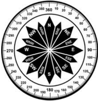
VRB- Variable Winds