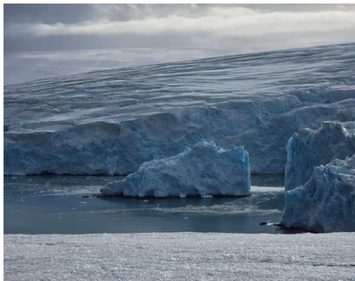
The first glimpse of the new island as seen from the glacier, March 31 st , 2026.