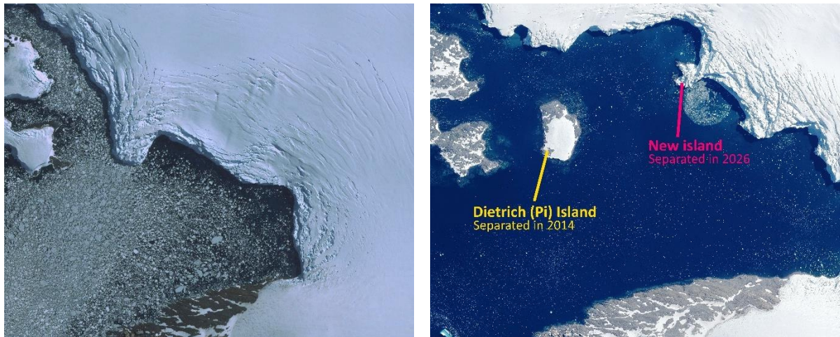
Figure 11. Arthur Harbor satellite imagery from December 2004 (left) and December 2025 (right).

On March 31 st , a new island was “born” in Arthur Harbor, separating completely from the glacier. This yet-to-be-named island sits less than ½ mile from Dietrich (Pi) Island, which separated from the glacier on March 14 th , 2014, or “Pi Day”.